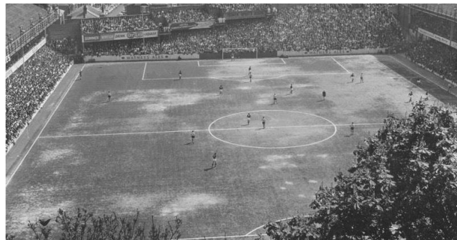
The Leed Stadium, 1910

to-back Columbian championships in 1902 and 1903 and a 3 rd one in 1908. This success spanned some major changes for the Seagulls, as the club moved to a newly built, £10,000 stadium called The Leed, to the northwest of the city centre in 1909. Although it would spend the next 103 years there, the future was far from certain in those early days and the club had to rent the premises first before it could stump up the cash to purchase the stadium in the early part of the 20th century.