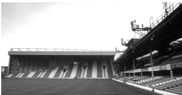
The Leed Stadion, 1990

changed its format to a closed 24 team with regular season and play-offs, Beatrix, along with other teams competed again in local level in Columbia. From 1987 to 2004 and the new reformation of PSL, Beatrix would win 5 Columbian titles, having Queensland Utd as their big local rivals. They also came 2 nd in the 2001 PSC National, behind Titania Schottegut.