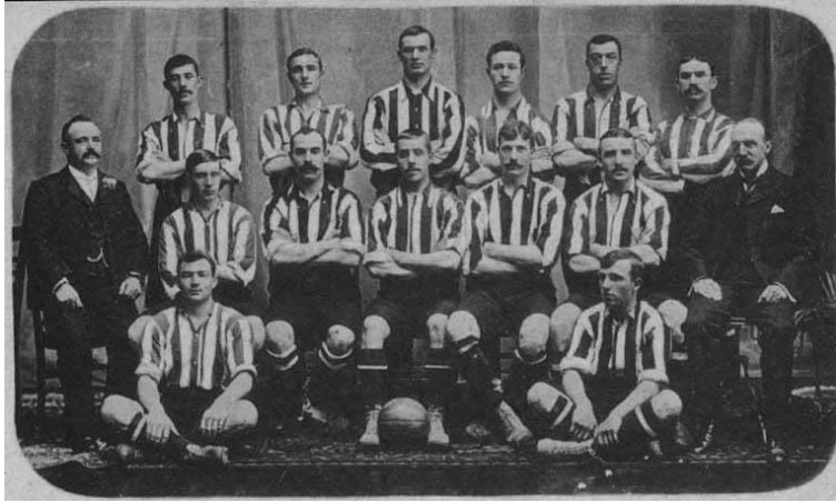
Columbia champions 1902

The club was originally known as St. Beatrix Young Men's Association FC (usually