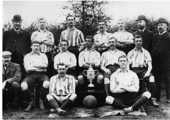
Kent Utd team with their 1 st Auroran Championship