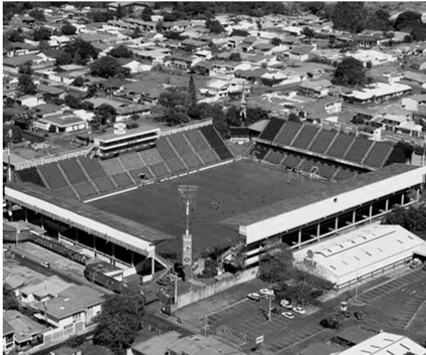
Kent Utd (Preeme Palver) Stadion

The project to find a proper site for a permanent home started in 1938 when the director of