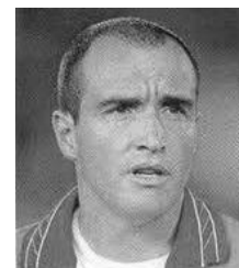
Moree De Bilt