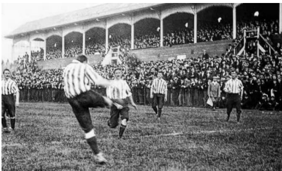
Olive Grove Stadium, Kent Utd vs Villa Town 1890

In 1887-88 the first Auroran Championship was held, as similar ones were held all over the island. The move to professionalism took the club from Bram Lane, which had taken a share of the ticket revenue, to the new Olive Grove Stadion. In 1888 the club became founder members of the AFA, of which they were the first champions. They repeated