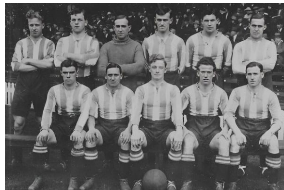
Kent Utd 1922