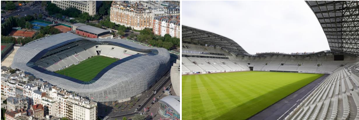
Nexus Columbia Arena

the stadium, all with unusual and dynamic shape that results in the new stadium's exciting texture, hardly comparable with any other. Both fans and extensive commercial spaces and 500-car underground parking are topped with a roof supported by 74 girders.