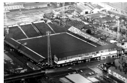
Stanel Park Athletics Ground

After struggling to repeat their 1896 success, the Queensland Utd board decided it was time to form a limited company, that helped the club to raise some money through shares. They also left Raikes Hall and moved to Stanel Park Athletics Grounds that could hold around 15,000 spectators. The club managed to win another two