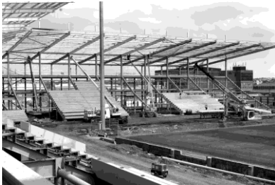
Stanel Park Stadion construction

would stay in the second division until 1947. A £12,000 transfer fee for defender Olav Ramis to Zaria, gave some breathing space to the club in 1949.