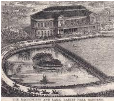
Raikes Hall Gardens

Football had developed in Queensland by 1877, when Queensland Victoria FC were founded as a church club with a ground in Caunce Street. This team disbanded a few years later but some of its members are understood to have merged with old boys from St John's School to form a new club called Queensland St John's. The two factions remained disunited, however, and on 26 July 1883, at