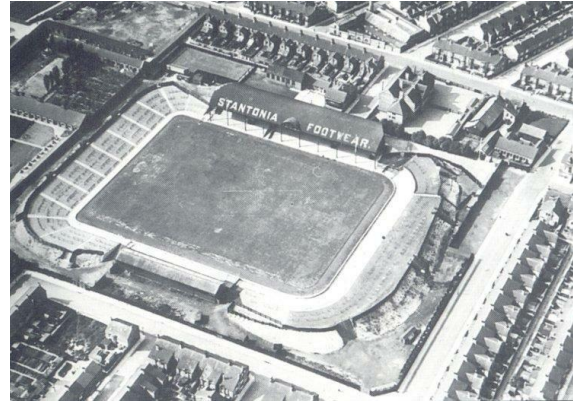
Somayr Park 1910's